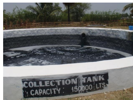
(d) Equalization and neutralization tank