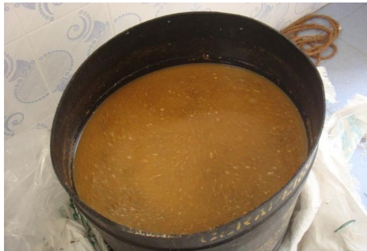
(a) Culture Formation – Starting Stage

Effluent samples collected from the laboratory were kept for 4 h to reach room temperature. A pH value of 7 was maintained by adding hydrochloric acid to the effluent. Lactobacillus acidophilus was added to the effluent was measured in the ratio of 1:100 (v/v) and the samples were stored for 4 days. Figure 3a and 3b show the culture at the starting stage and final stage respectively.