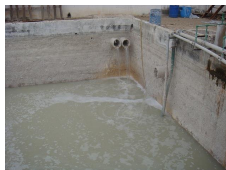
(b) Bleaching Collection Tank Biological methods