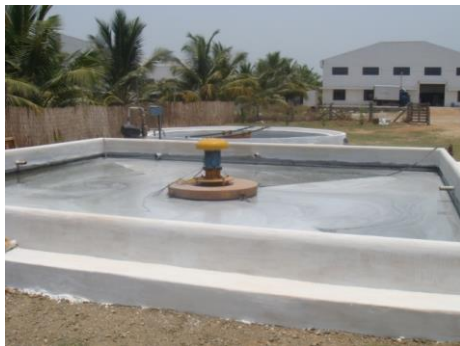
(i) Treated effluent before sludge formation