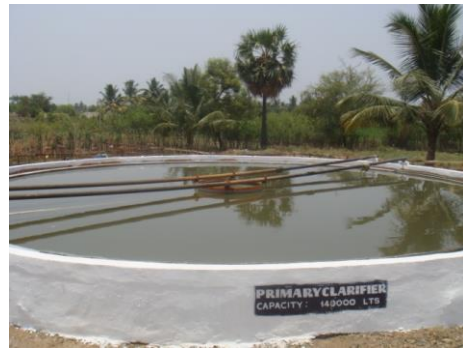
(f) Primary Clarifier