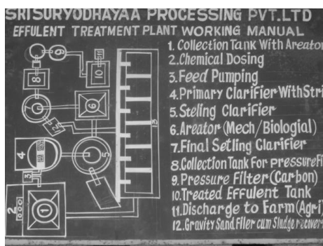
(a) A Process Flowchart at the plant

In the Figure 1, the clarifier zone, all the larger solids and all sorts of refuse that has arrived with the effluents are removed. Then, the collection tank receives the effluents and in an equalization tank a pH value of 7 was maintained by adding hydrochloric acid to the effluent. Flash mixing is used to evenly distribute coagulating chemicals in the effluent, allowing micro-flocks to form. As the precursor to flocculation, flash mixing increases the efficiency of flocculation and reduces chemical wastage. Then, the clariflocculators are used for chemical primary treatment and enables to handle heavy slugs while delivering shortest flock settling time. Clarifiers are used for reducing suspended solids load by coagulation and settling method. The purpose of a clarifier is to remove solids, produce a cleaner effluent and concentrate solids were shown in Figure 2 Plant process flowchart using Biological methods (Figures 2a to Figure 2l). Finally Lactobacillus acidophilus was used to treat the cleaner effluent and makes it colourless with significant reduction of treated effluents.