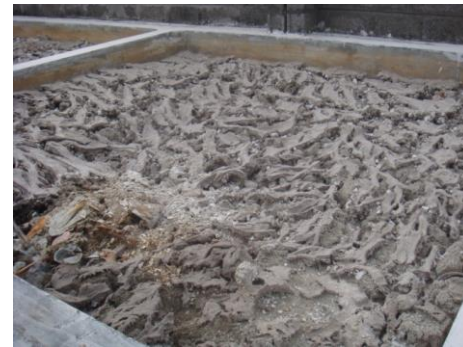
(l) Water before and after Pre-treatment