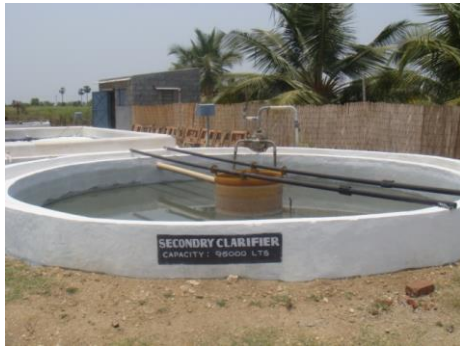
(g) Secondary Clarifier