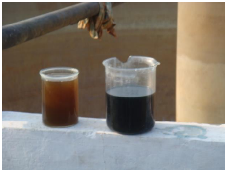
(k) Sludge Formed