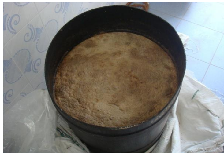
(b) Culture Formation – Final Stage