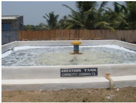
(e) Aeration Tank