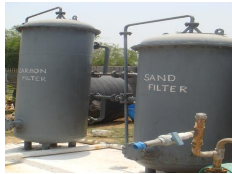
(h) Tertiary Treatment