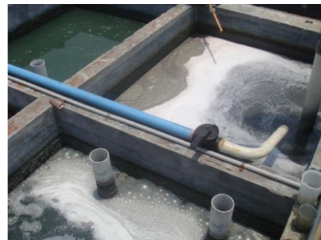
(j) Before Sludge Formation